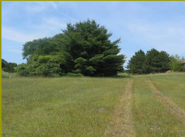
View of building site from the water

The best of the last vacant building sites on Walloon Lake. A rare opportunity to build your dream home on this private 1.48 acre waterfront site. This lot features a gradual slope to the water's edge and would be ideal for a walk-out lower level. The private road is well maintained and would allow for easy construction access.