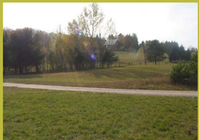
View of the farm to the west