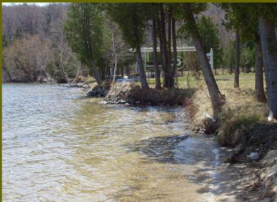
Hard sandy bottom